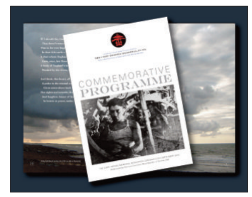
To purchase copies of the Commemorative Programme price £3.00 plus postage, see the address below.

We had to beg borrow and scrape to get the project completed, but the sun shone, and at around £35,000, we have achieved an amazing result, in what must be record time. With stage one completed, we can consider what more we should do to consolidate the COPP story, and bring it to a much wider audience. There have been some approaches and interesting conversations with significant people. With their support it is possible we could achieve very much more.